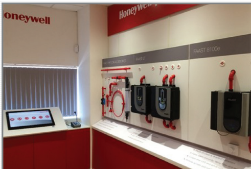
Flexible training options include attendance at a Honeywell training facility, your premises or on-line.

Attendees are presented with an award certificate upon training completion.